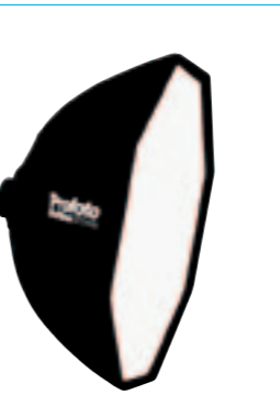
Softbox Octa Softbox 2.3' Octa (70cm) – 25 45 78 Softbox 2x3' Octa Gold (70cm) – 25 45 79 Softbox 3' Octa (90cm) – 25 45 28 Softbox 5' Octa (150cm) – 25 45 29