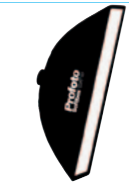
Softbox StripLights Softbox 1x3' RF (30x90cm) – 25 45 36 Softbox 1x4' RF (30x120cm) – 25 45 24 Softbox 1x6' RF (30x180cm) – 25 45 34