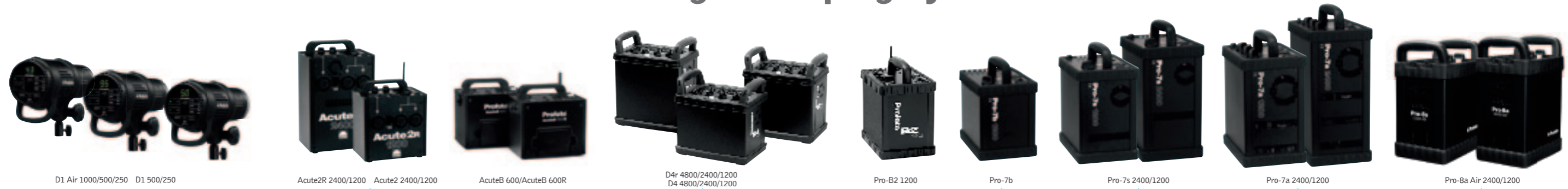
D1 Air 1000/500/250 D1 500/250