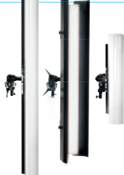
StripLights S 0.7m – 10 07 35, M 1.3m – 10 07 36 L 1.9m – 10 07 37. Optional barn doors are available for all StripLights.