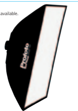
Softbox Rectangular Softbox 1x1.3' RF (30x40cm) – 25 45 76 Softbox 2x3' RF (60x90cm) – 25 45 26 Softbox 3x4' RF (90x120cm) – 25 45 27 Softbox 4x6' RF (120x180cm) – 25 45 35