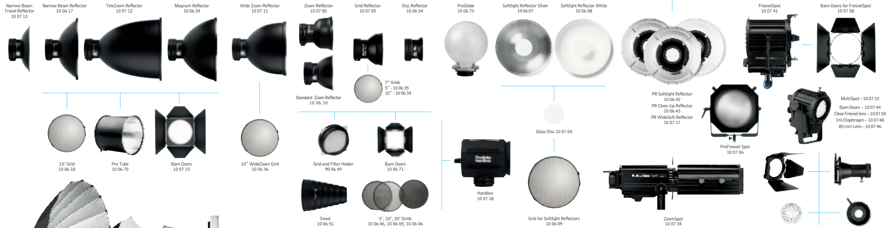
Narrow Beam Travel Reflector 10 07 13