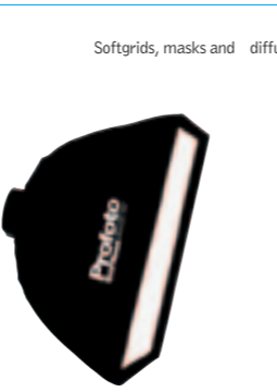
Softbox Square Softbox 2x2' RF (60x60cm) – 25 45 25 Softbox 3x3' RF (90x90cm) – 25 45 77