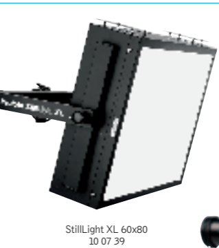
StillLight XL 60x80 10 07 39 StillLight XXL 80x120 10 07 40