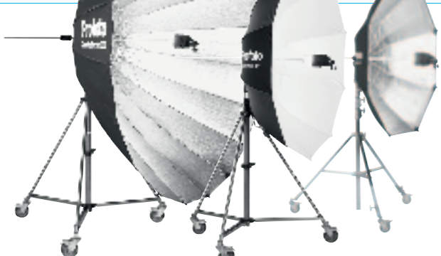
The line of Profoto Giant Reflectors consists of the parabolic Giant Reflectors 180 cm – 10 03 18, 240 cm – 10 03 19, 300 cm – 10 03 20, plus the Giant White 150 cm – 10 03 14, Giant White 210 cm – 10 03 15, Giant Silver 150 cm – 10 03 16, and Giant Silver 210 cm – 10 03 17. Optional front diffusers are available for all Giants.