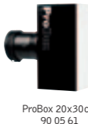
ProBox 20x30cm 90 05 61