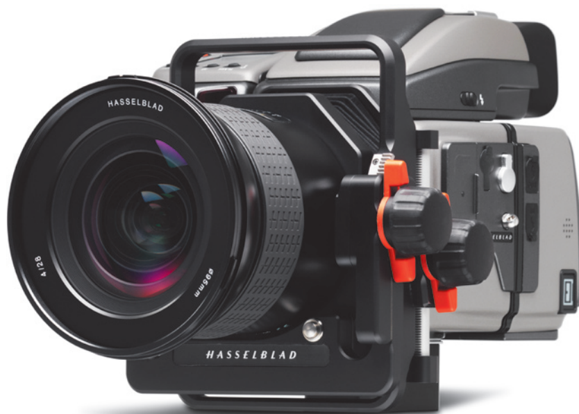
H3DII with HTS 1.5 tilt/shift adapter and a HCD 28mm lens.

Please refer to the separate datasheet on Hasselblad View Camera solutions for details.