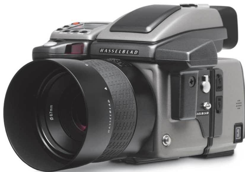
H3DII with the GIL GPS recording device attached.