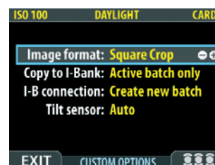
Image format can easily be selected between full format (39 Mpixel) and Square crop (29 Mpixel)